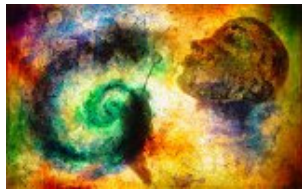
Bubbles into the Universe Digital Print - 12" x 17"