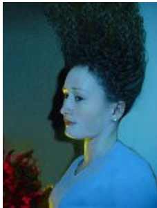
Marge Simpson's Secret Digital Print - 17" x 12"