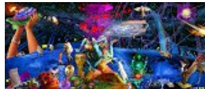
Picnic on the Moon Digital Print - 42" x 96"